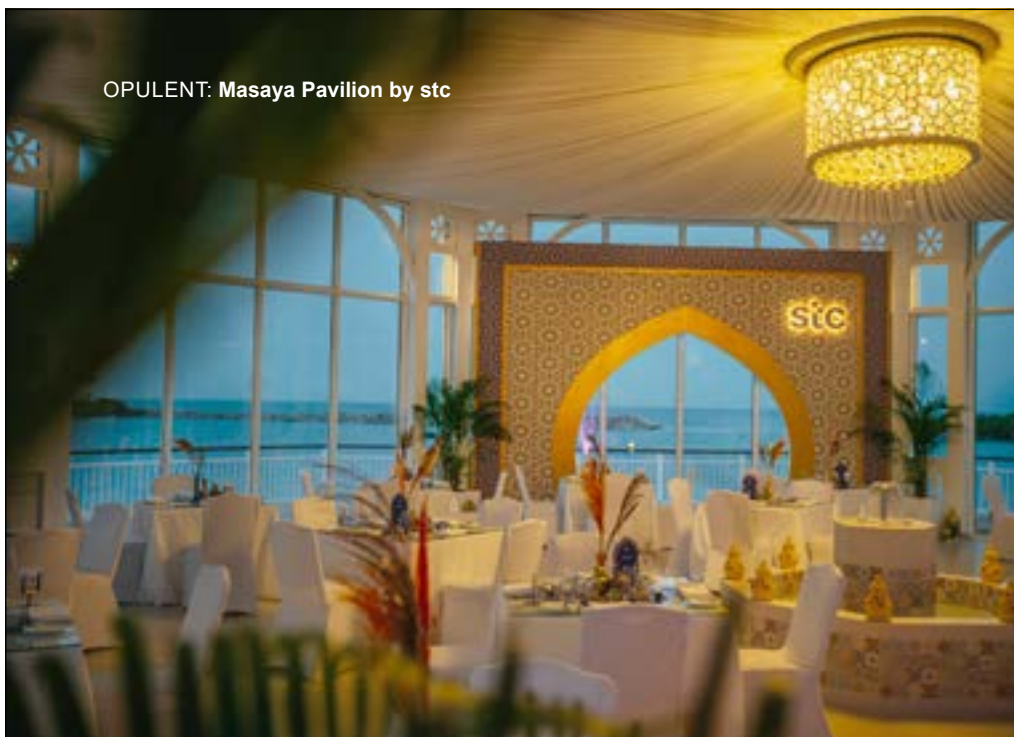
OPULENT: Masaya Pavilion by stc

F OR the ultimate Ramadan celebration, visit The Ritz-Carlton Bahrain's Masaya Pavilion by stc.