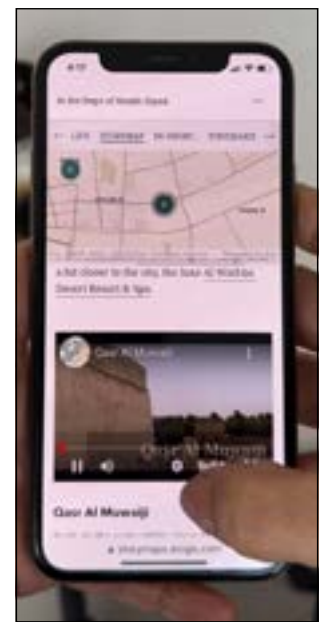
DIGITAL: The guide interface as seen on a mobile device

The creative lived in Bahrain for seven years with her husband and hopes to