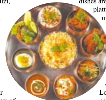
COLOURFUL: Dishes at La Med's The Great Indian Iftar Thali

For more information or bookings, call 17586425 or email rc.bahrz.restaurant.reservations@ritzcarlton.com .