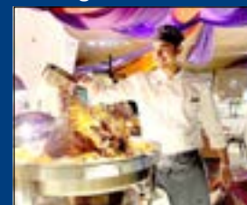
CHARM: Ramadan tent at the Royal Golf Club