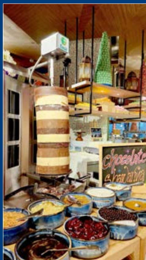
DECADENT: Tasty desserts at Hilton Bahrain

For more information or bookings, call 33692013.