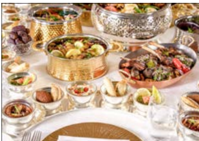
TASTY: Dishes at the hotel's Premium Experience

available everyday from 9pm to 2am. Price depends on the set menu, starting from BD55 per person, and tables can be booked for a minimum of four guests.