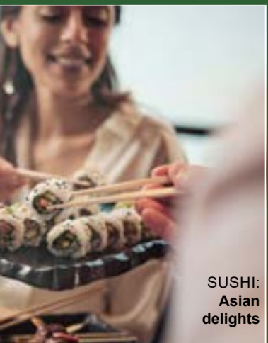
SUSHI: Asian delights

For more information or reservations, call 17115500 or 17115070.