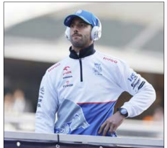
UNCERTAIN: Ricciardo ready to prove he has what it takes to continue racing in F1