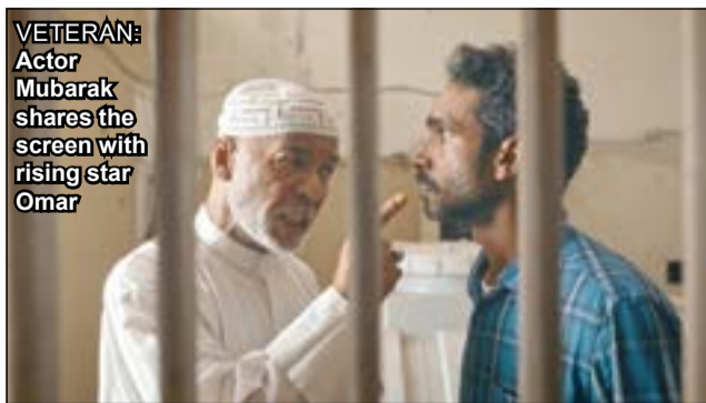
VETERAN: Actor Mubarak shares the screen with rising star Omar

For more details, follow @hashimsharaf on Instagram.