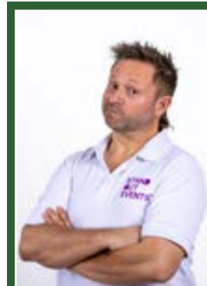
PLAY FOR POOCHES BSPCA quiz night SEE PAGE 2