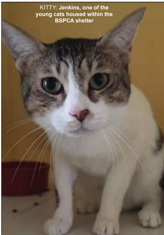
KITTY: Jenkins, one of the young cats housed within the BSPCA shelter