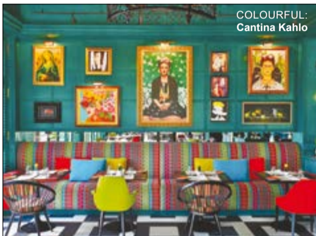
COLOURFUL: Cantina Kahlo

For more information or reservations, call 17586401 for La Med and Cantina Kahlo, and 17586499 for Thai Lounge, or email rc.bahrz.restaurant.reservations@ritzcarlton.com