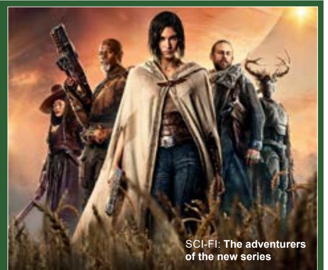
SCI-FI: The adventurers of the new series

The cast boasts a stellar lineup, with Sofia Boutella reprising her role as Kora alongside returning stars like Djimon Hounsou, Ed Skrein, and Michiel Huisman.