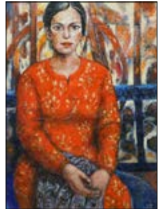
LEGACY: Lady in Red (Oil on Canvas, 2020)