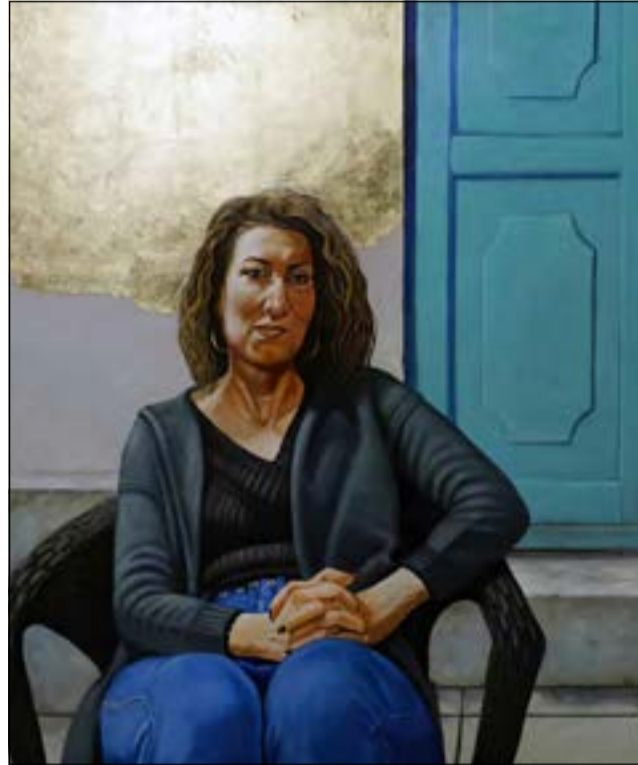
POIGNANT: Meditation Moments (Oil on Canvas, 2003)