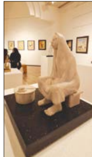
TRADITION: Asghar's Beans Seller marble sculpture