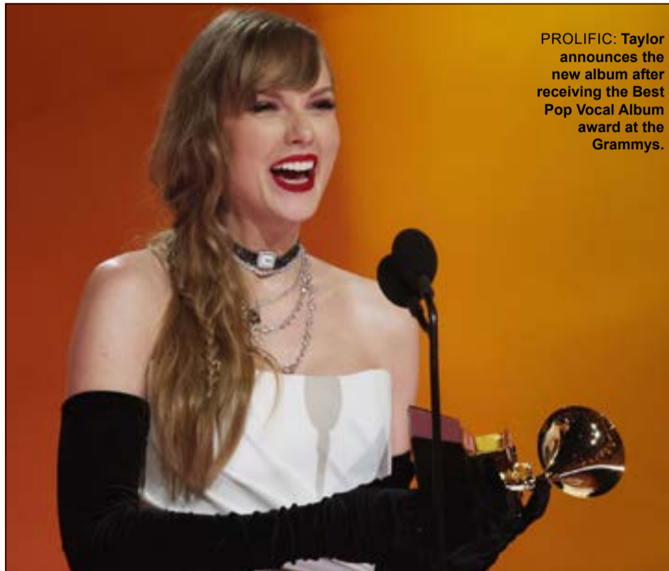
PROLIFIC: Taylor announces the new album after receiving the Best Pop Vocal Album award at the Grammys.

While known for her genre-bending versatility, some reports suggest a return to her signature pop sound with a