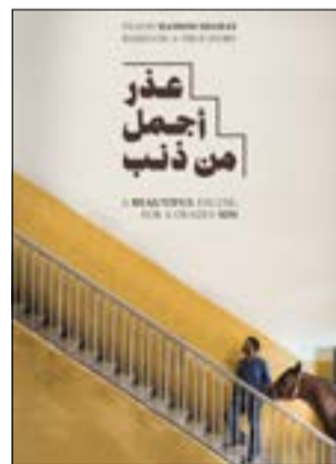
ARTISTIC: The film's poster

"We don't pay attention to other people's problems as long as they don't affect us, but one day, they might catch up to us, so, let's come together to support others," Hashim explained, highlighting that caring for