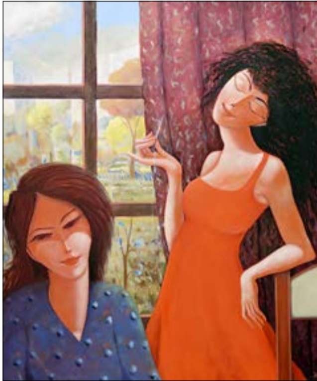
HERITAGE: Needle and Thread (Oil on Canvas, 2012)