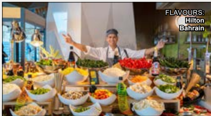
FLAVOURS: Hilton Bahrain

For more information or reservations, call Block 44 at 33690081.