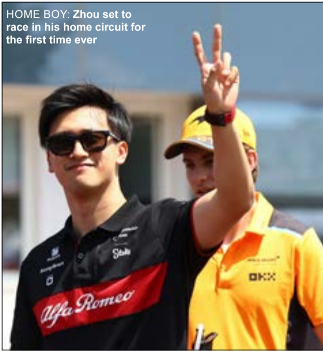
HOME BOY: Zhou set to race in his home circuit for the first time ever

can compete on a track historically favouring Red Bull bodes well for the upcoming races, particularly in Shanghai, which is known to be more front-limited in terms of performance.