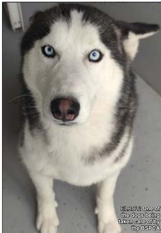
ELROY: One of the dogs being taken care of by the BSPCA