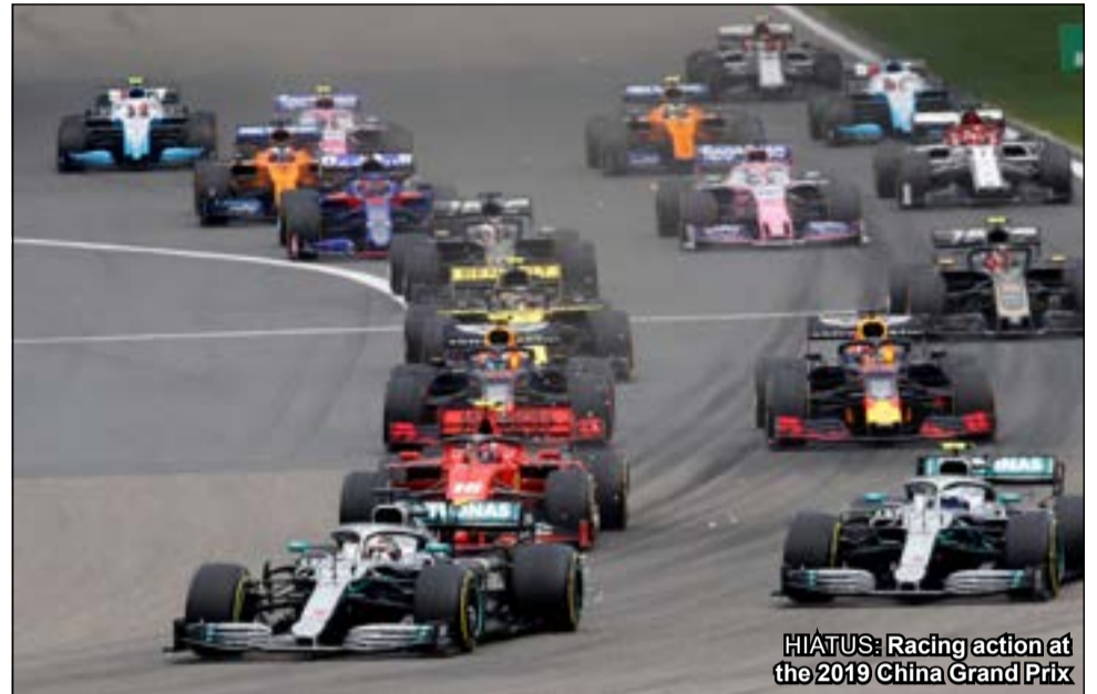
HIATUS: Racing action at the 2019 China Grand Prix

The team has confirmed that the car is generating the targeted downforce levels on