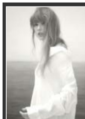
PULSE OF POP Music, movies & more SEE PAGE 6