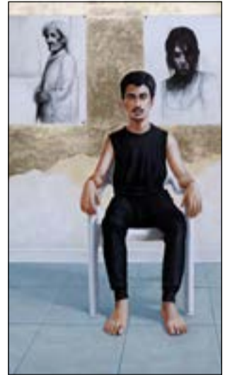
REALISTIC: Yusuf (Oil on Canvas, 2023)