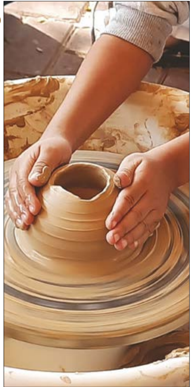
MOULD: A shot of a Bahraini potter at work

Soniya plans to continue pursuing photography as a passion, though she is clear she doesn't want to make it a profession because 'that might take the fun out of it!'