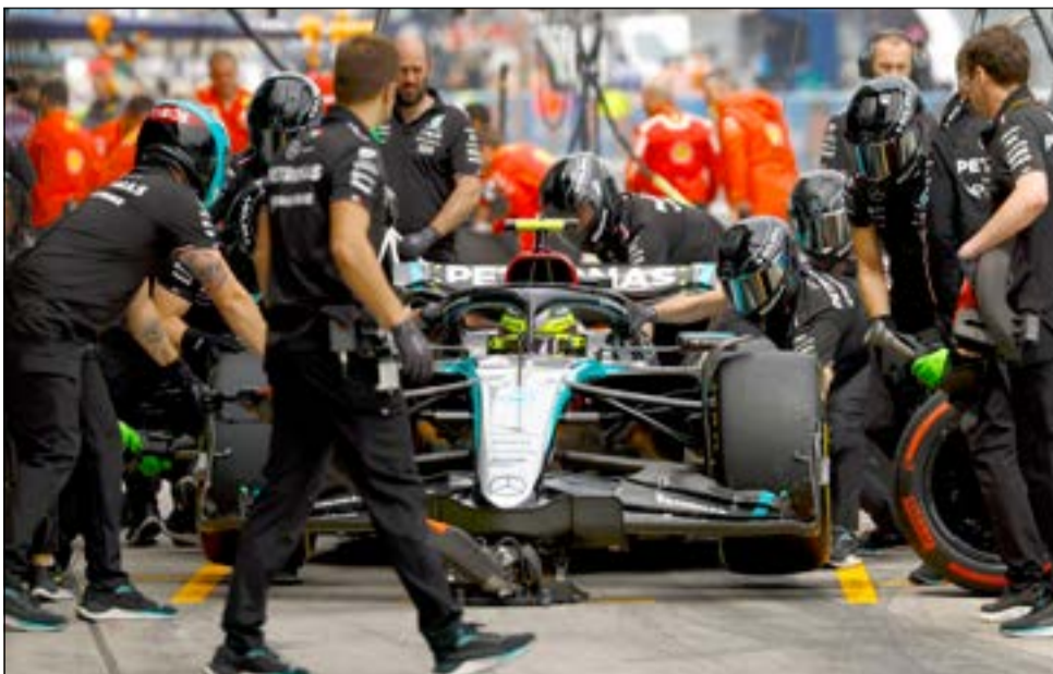
PITTED: The Silver Arrows need to make significant changes to stay competitive this year

This shift hands the coveted season opener slot back to Australia. China will be the second race on the calendar, followed by Japan.