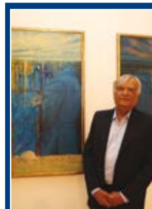
BRUSH WITH ART Asghar's journey SEE PAGE 3