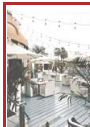
LEISURE SCENE Dining and night life SEE PAGES 4-5