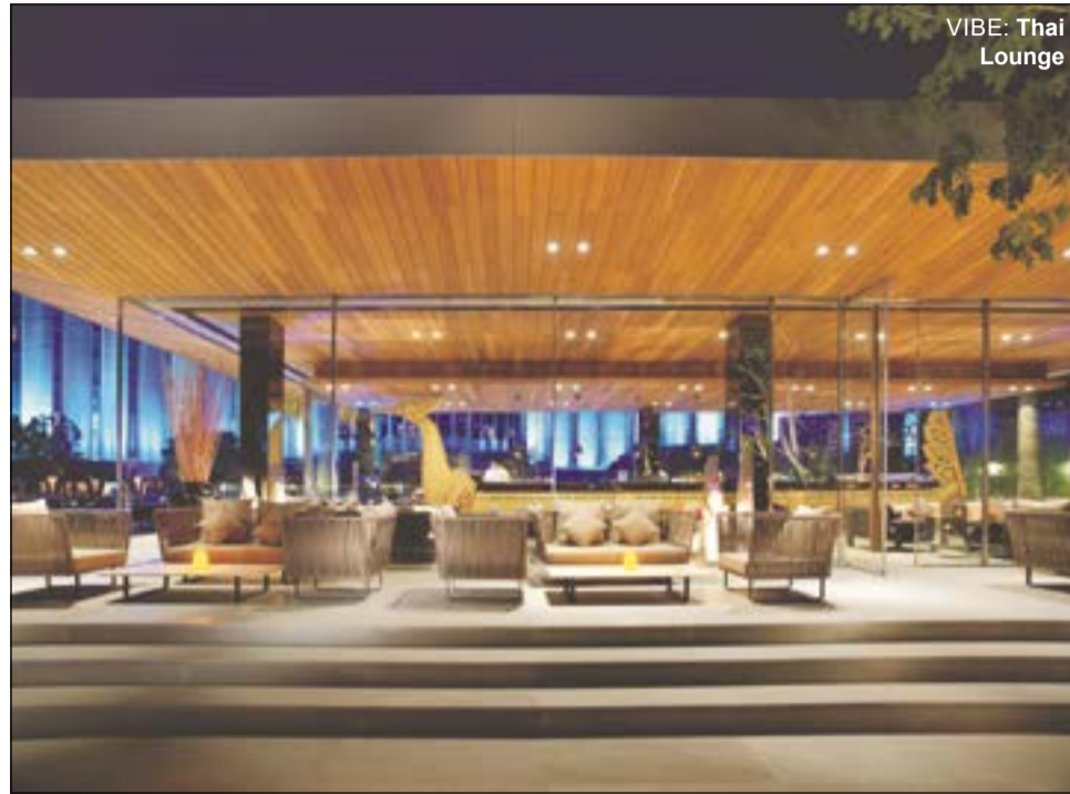
VIBE: Thai Lounge

To cater to diverse preferences and desires, La Med presents four distinct packages: The introductory option, priced at BD29, invites guests to savour an array of tantalising dishes paired with traditional tea