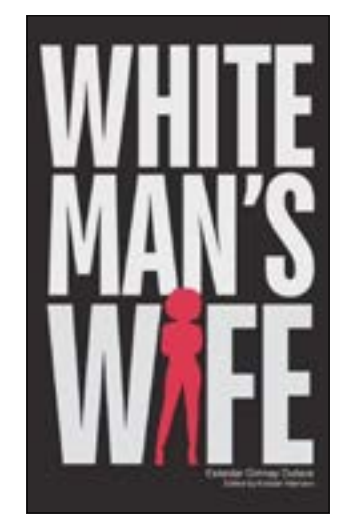
RELEASED: The book cover

"We have this misconception that if you are with a foreigner, it's because