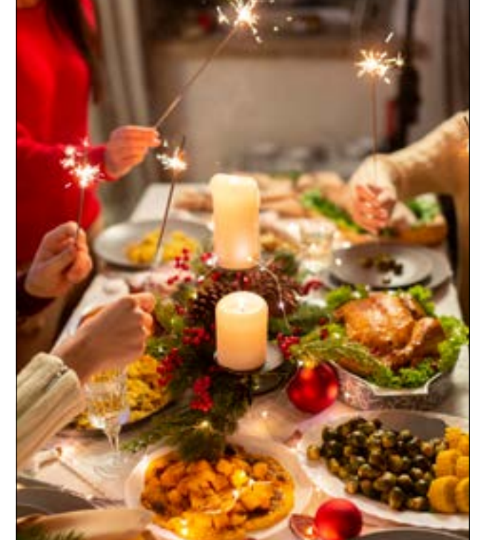
CELEBRATION: Coming together for Thanksgiving

For more information, contact 33692013 or 33690081.