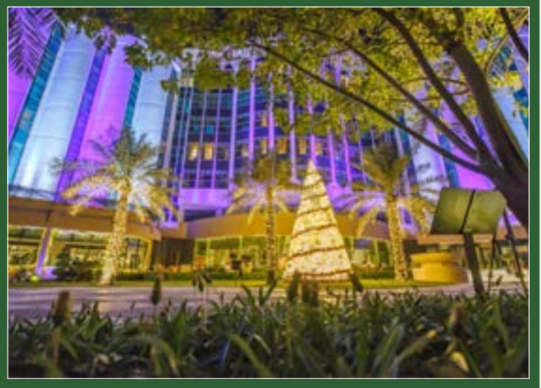
SPECTACLE: Trees lit up for the festive season in the hotel's garden

Get in the holiday spirit with the Ritz Gourmet Lounge's and Lobby Lounge's Festive High Tea, from 3pm to 7pm, everyday. Delight in a selection of freshly baked scones, gourmet cakes,