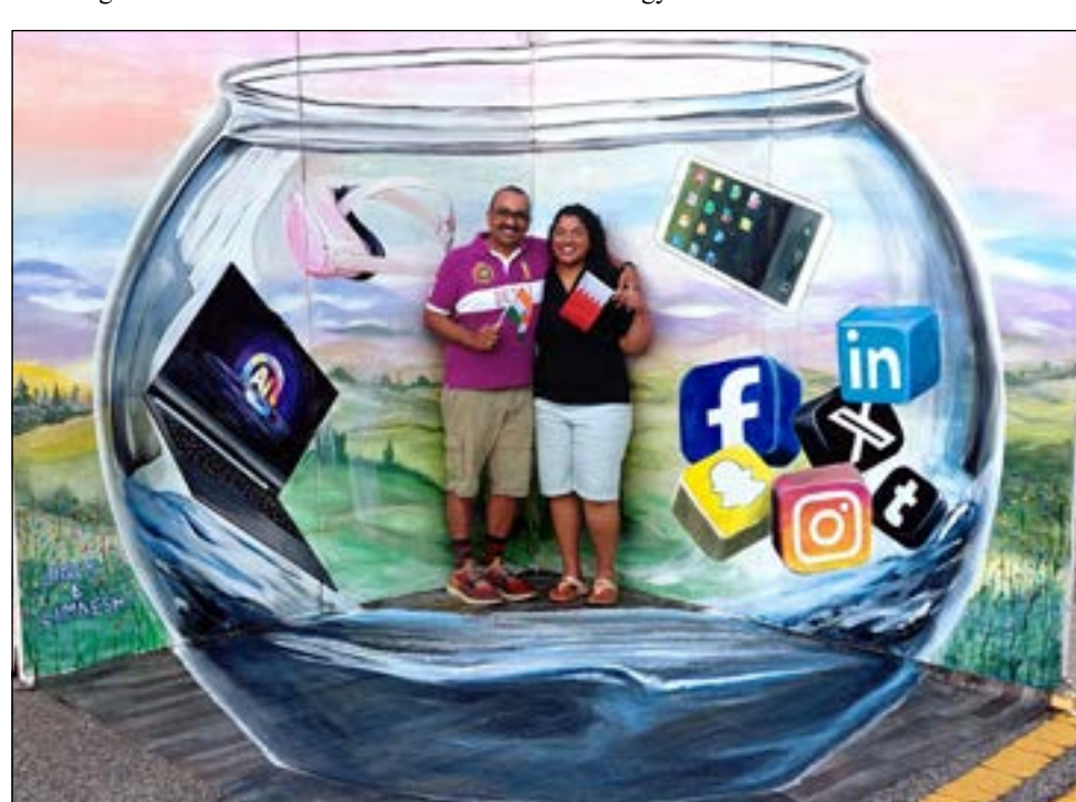
TEAMING UP: The couple representing Bahrain and India with Digital Aquarium