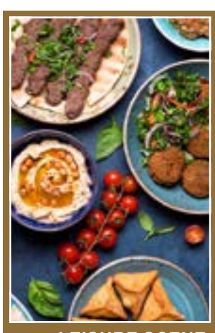
LEISURE SCENE What's on in Bahrain SEE PAGES 4-5