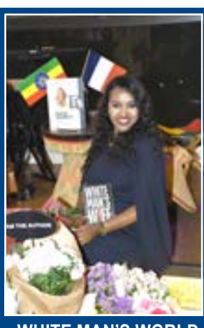
WHITE MAN'S WORLD New book release SEE PAGE 6