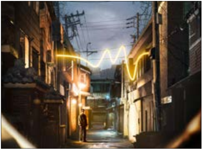
LIT UP: A poster of the series

"This series unravels the stories that couldn't be shown in the webtoon, and the actors have been able to portray them in a more three-dimensional way," he added.