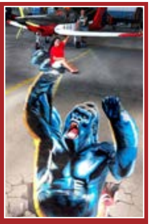
MAGICAL MURALS Local artists shine SEE PAGE 3