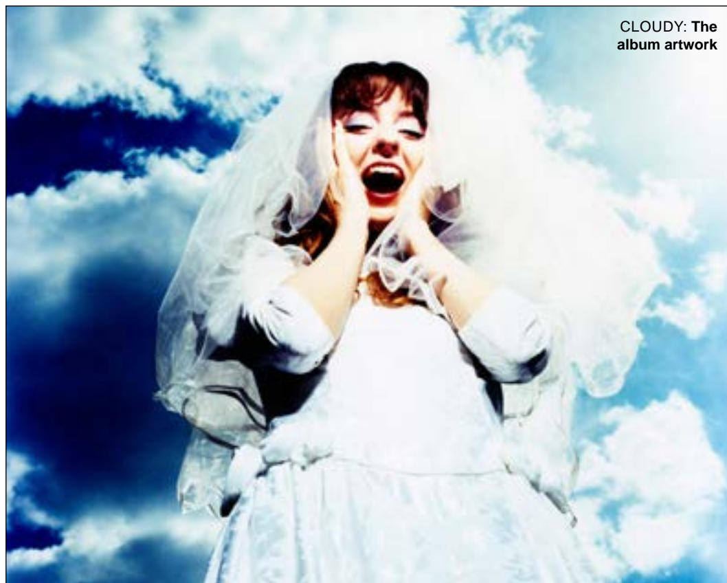
CLOUDY: The album artwork

AROUND THE WORLD IN MUSIC, TV, BOOKS AND MORE - BY RIMA ALHADDAD