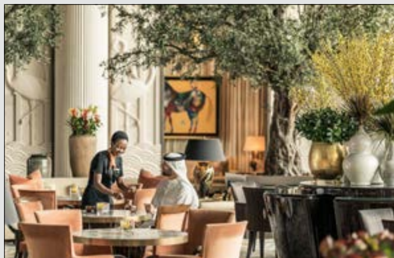
LUXURIOUS: Bay View Lounge