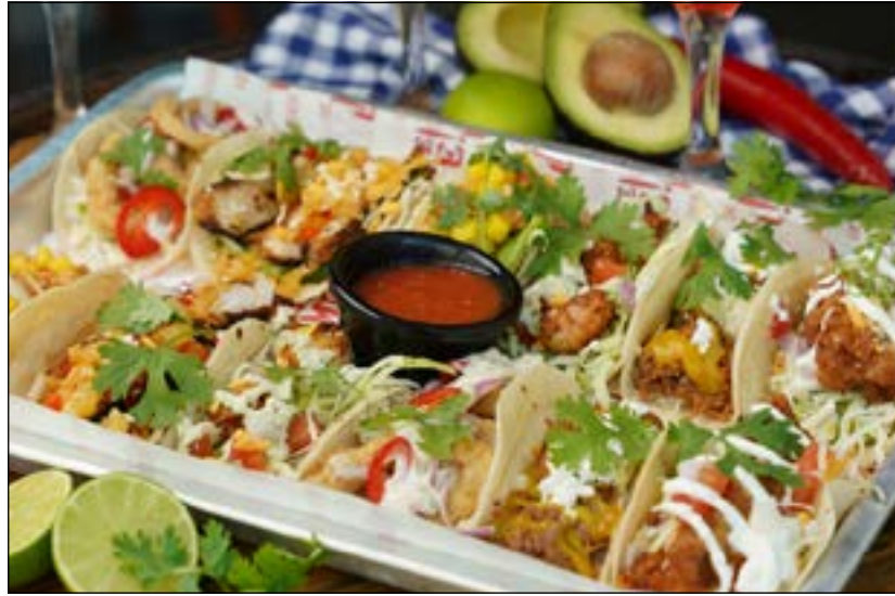
FLAVOUR: Taco Tuesday

For a relaxed start to the day, Origin Kitchen and Culture serves a lavish breakfast buffet from Sunday to