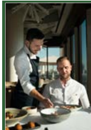
NEW YEAR SPECIAL Fun and dining SEE PAGES 2-3