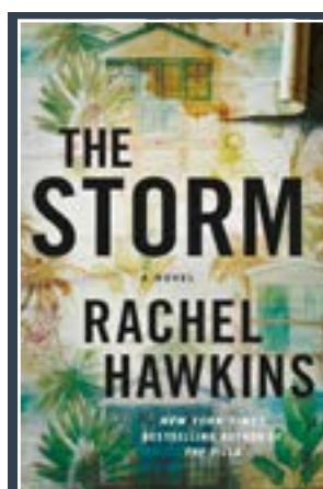
THRILLER READ New novel release SEE PAGE 6