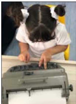
LEARNING: A child from the society's kindergarten using a braille typewriter

"Our Braille training this year was attended by around 17 candidates comprising not just visually impaired individuals but also teachers who wanted to equip themselves with the knowledge. The candidates were as young as 10 years going up to as high as 40 years. This is part of the many events that we conduct all year round," he added.