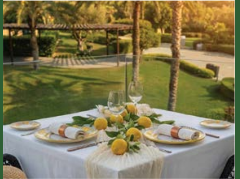
CLASSIC: Primavera Brunch

B EGIN the New Year at the Ritz-Carlton, Bahrain, with a thoughtfully curated collection of experiences where exceptional cuisine and crafted beverages set the stage for memorable moments.