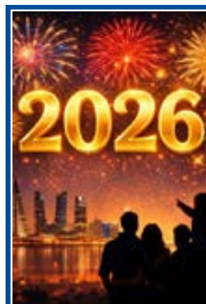
FLASHBACK 2025 The year gone by... SEE PAGES 4-5