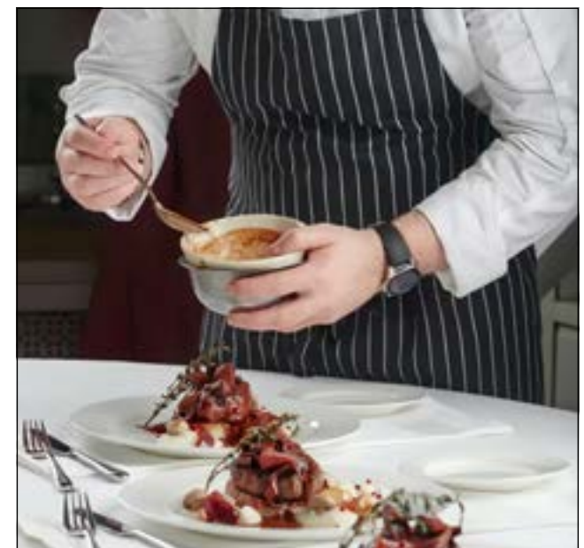
ELEGANT: French gastronomy

For more information, contact 17208308 or 36967701.