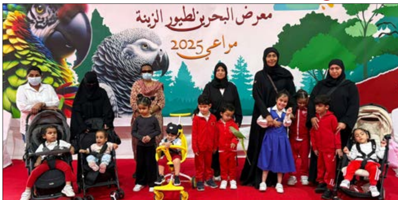
HAPPY: The society's volunteers and children at a past event