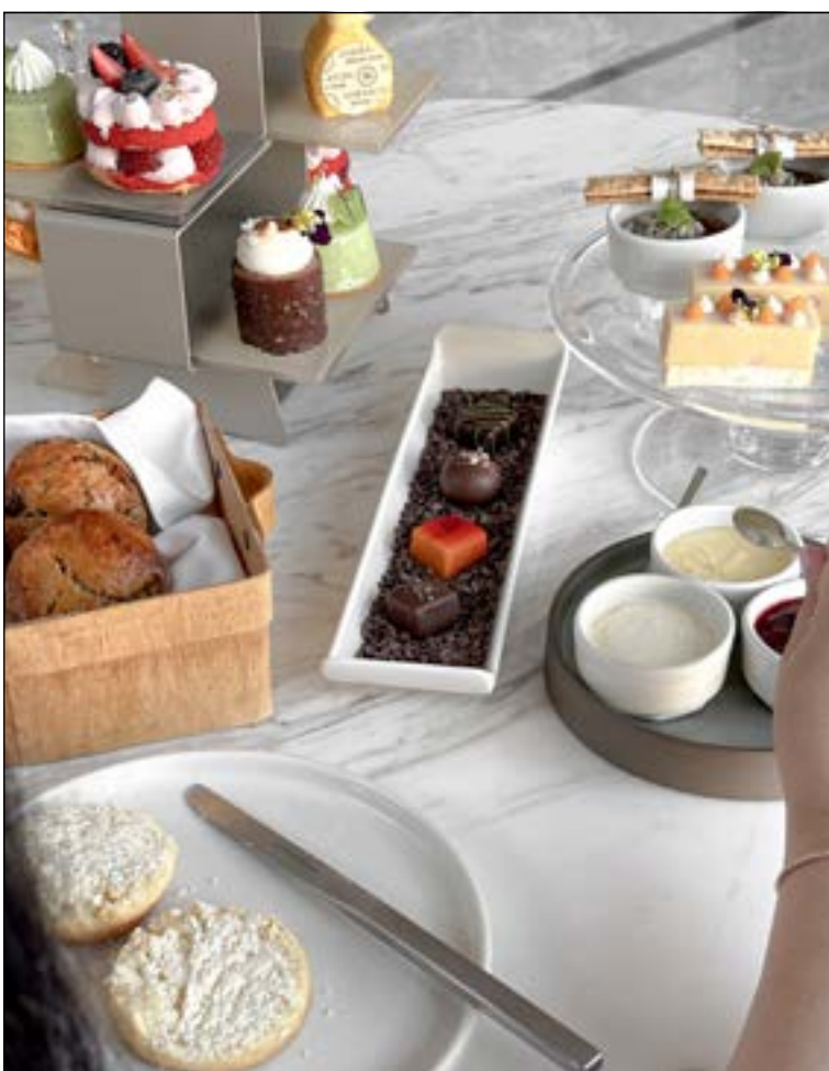
RELAXING: Tea time

For details, call 17586499 or email rc.bahrz.restaurant.reservations@ritzcarlton.com .