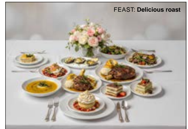
FEAST: Delicious roast