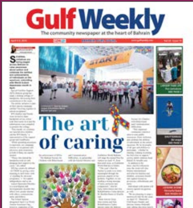
APRIL: ISSUE 14 - A number of organisations came together to raise awareness about autism and celebrate the abilities and achievements of individuals on the spectrum, as part of their activities commemorating World Autism Awareness month. 'Growing together in autism acceptance' was the theme of the campaign, which included the annual Run for Autism on April 19.