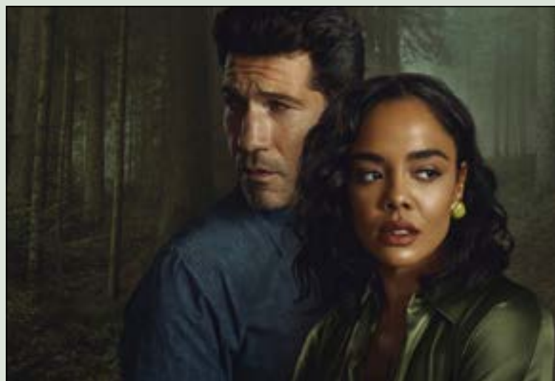
WHODUNIT: A promotional image of the series