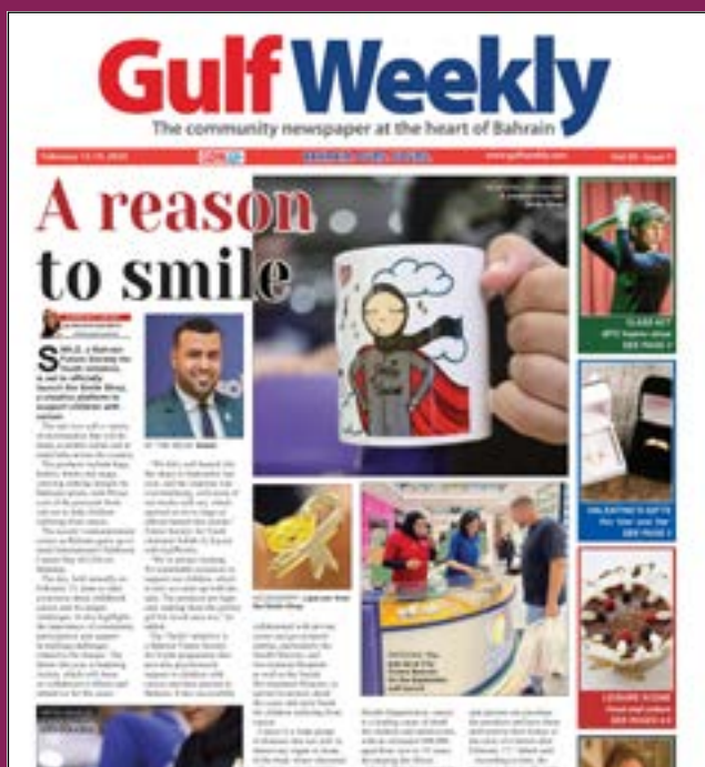
FEBRUARY: ISSUE 7 - To mark International Childhood Cancer Day, Smile, a Bahrain Future Society for Youth initiative, launched its Smile Shop, a creative platform to support children with cancer selling bags, bottles, books and mugs featuring striking designs by Bahraini artists, with 80 per cent of the proceeds from sale set to help children suffering from cancer.