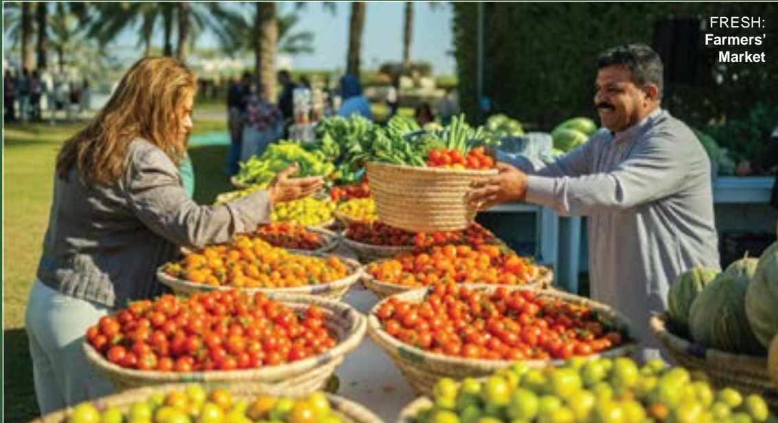
FRESH: Farmers' Market