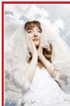
POP TUNES New album drop SEE PAGE 6