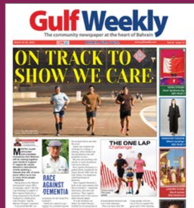
MARCH: ISSUE 12 - Mental health advocates from Bahrain came together to support F1 legend Sir Jackie Stewart's international charity tackling dementia, during a one-lap challenge around the Bahrain International Circuit. The One Lap Challenge in support of Race Against Dementia took aim at a disease that will, at some point, affect up to one in every three people worldwide.