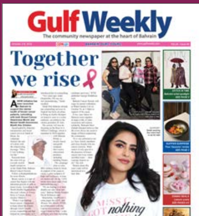
OCTOBER: ISSUE 40 - A new initiative was launched to support the mental health of breast cancer patients, coinciding with both Breast Cancer Awareness Month and Mental Health Awareness Month, featuring t-shirts with the empowering message: "Miss C Got Nothing On Me." Proceeds went to mental health initiatives of the Think Pink: Bahrain Breast Cancer Society.